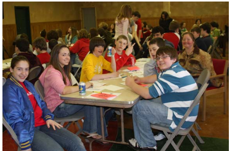
2009 Confirmation Retreat

CONFIRMATION CELEBRATION SUNDAY, MARCH 14, 2010 DURING 11:00 A.M. MASS